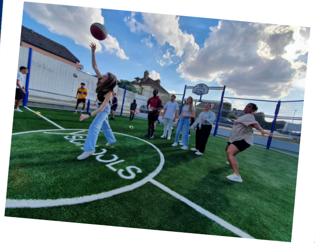
Y SCHOOLS multi-sport stadium