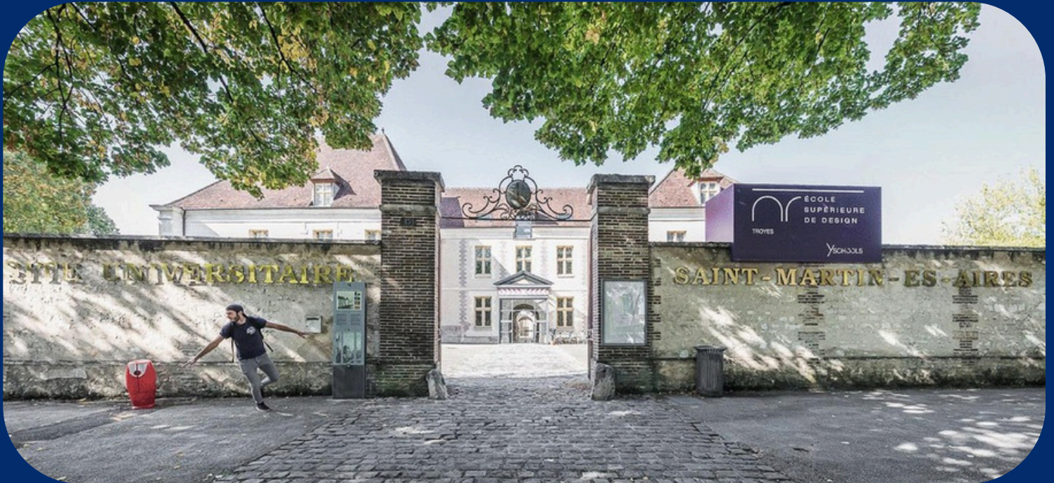
Campus St. Martin Troyes – Design School