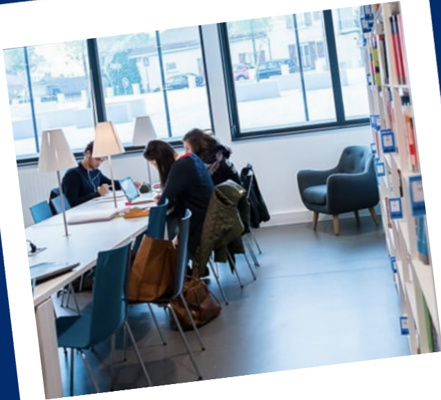
University Library - Y LAB