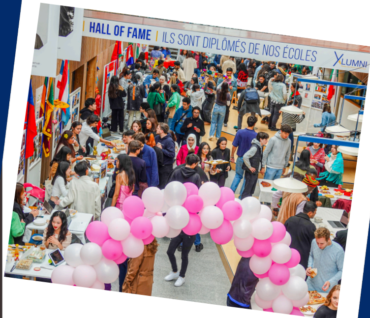
Cultural Forum Event