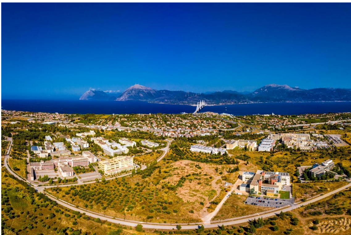
University of Patras, Rio Campus

University of Patras Students Social Welfare: https://socialwelfare.upatras.gr/?lang=en