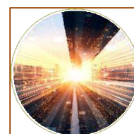
Students' public transportation card