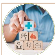
French Healthcare for students

Exchange students are advised to be present a week before the 'Welcome Day' to adjust themselves to new environment and to prepare all administration requirements when arriving in France.