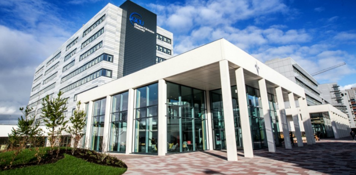
GCU Campus – Annie Lennox Building