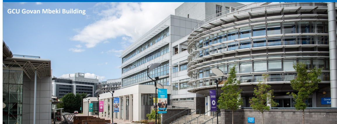
GCU Govan Mbeki Building

After submission, students 6 module preferences will then be reviewed by academic members of staff using the transcript of records provided at application stage. The timetabling team will also review preferences to ensure that there are no clashes. You will then receive confirmation for 3 of your module preferences from GCU's Central Academic Support Team.