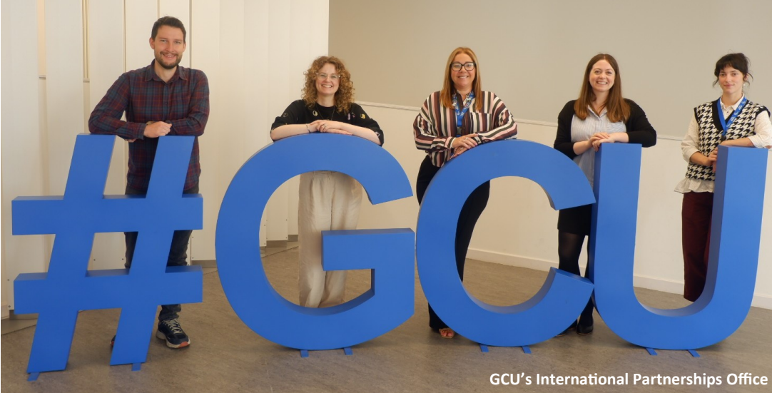
GCU's International Partnerships Office