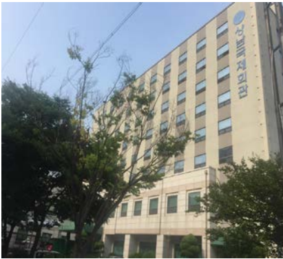
PNU Sangnam International House