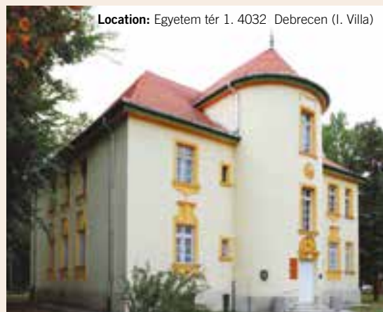
Location: Egyetem tér 1. 4032 Debrecen (I. Villa)